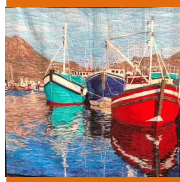
National Quilt Museum