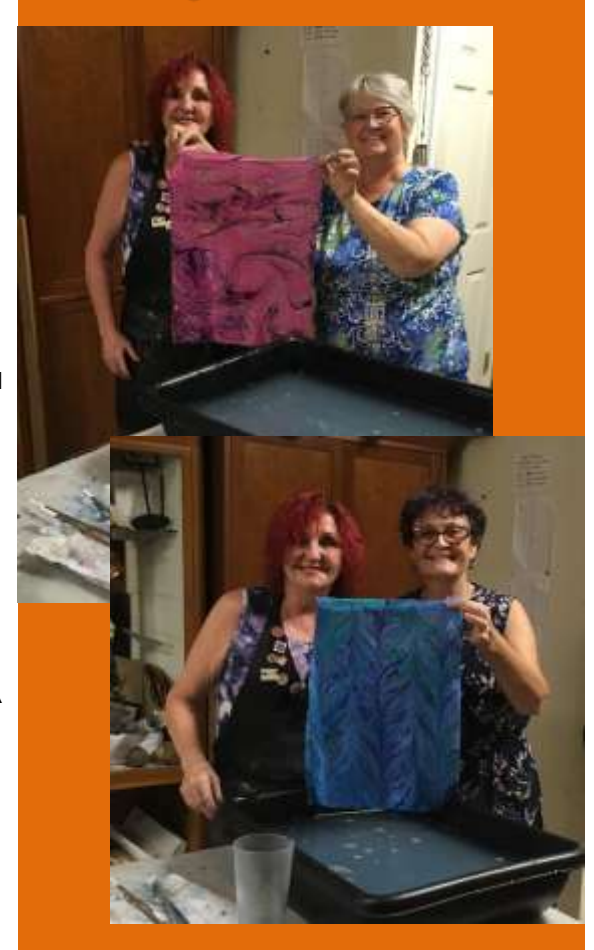
A few of my favourites